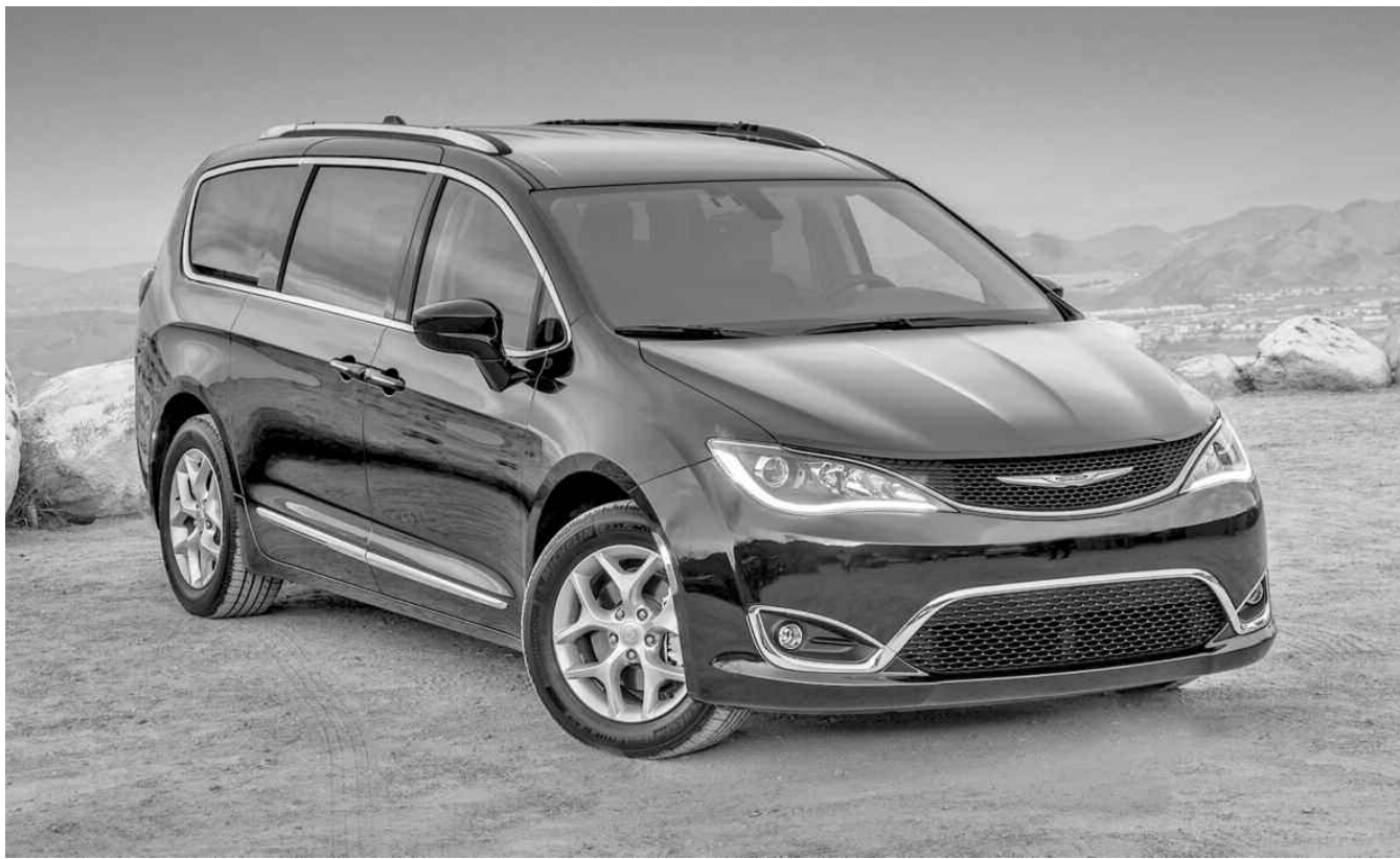
WardsAuto has named the all-new 2017 Chrysler Pacifica to the first-ever Wards 10 Best User Experience List for 2016.

As the original creator of the minivan more than 30 years ago, FCA US LLC has transformed the segment